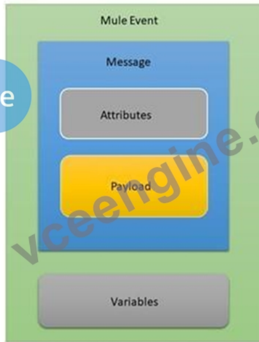
MuleSoft.U Mule 4 for Mule 3 Users