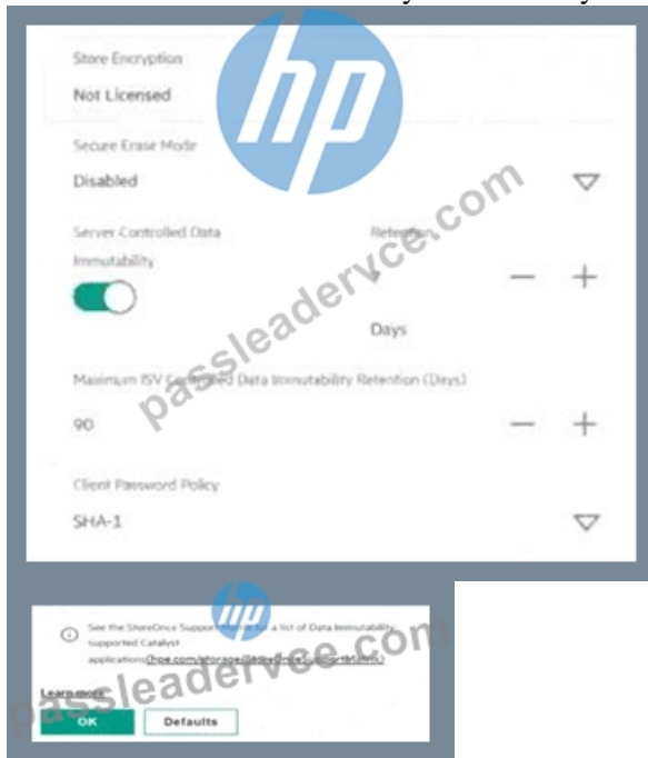
Exhibit shows HPE StoreOnce Catalyst Store Security Settings:

Server Controlled Data Immutability enabled (7 days).