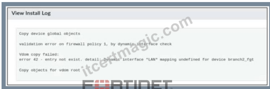
Exhibit A shows a policy package definition. Exhibit B shows the install log that the administrator received when he tried to install the policy package on FortiGate devices.

Based on the output shown in the exhibits, what can the administrator do to solve the issue?