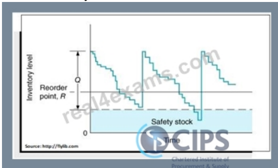
Figure 1: Safety stock graph

Safety stock is also known as buffer stock. As this name suggests, this type of stock provides some kind of 'buffer', which means safety stock will help the business to reduce the shocks induced by volatile demand or disruption on the supply chain. In other words, safety stock will reduce the probability of stockouts. The following graph would explain the reason why an organisation should have safety stock: