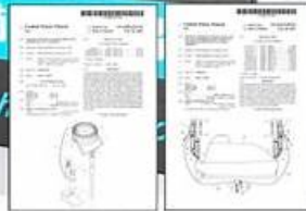
美國專利 United States Patent