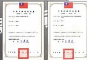
台灣專利 Taiwan Patent