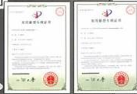
中國專利 China Patent