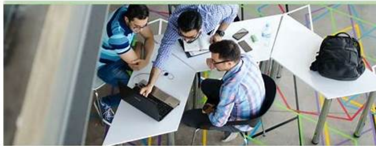
Preparing for the JN0-452 Juniper Mist AI Wireless, Specialist (JNCIS-MistAI-Wireless) Exam

P.S. Free 2025 Juniper JN0-452 dumps are available on Google Drive shared by TestSimulate: https://drive.google.com/open?id=1vmwMcBlfjTU_omywQggvWKYQxr82l5a0